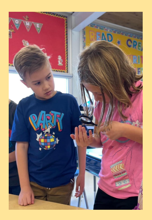
Grade 3&4 grew crystals!