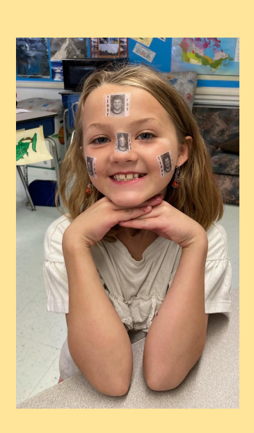
Terry Fox Run was a success

Was great to see everyone at the Pancake Breakfast.